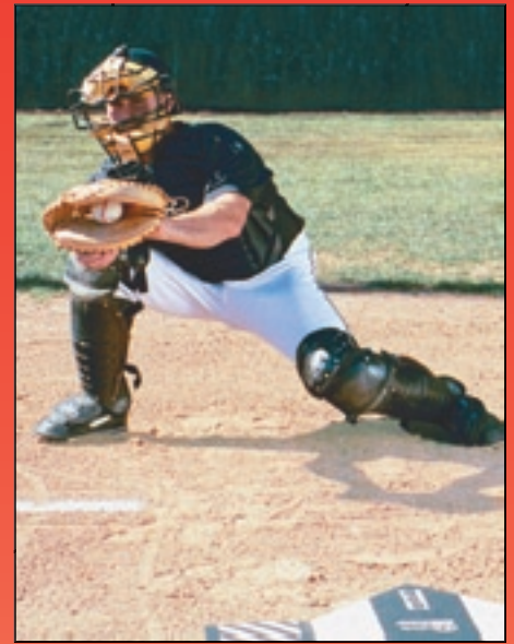
Back Leg Drop