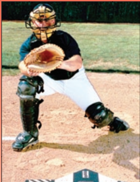
Back Leg Clear