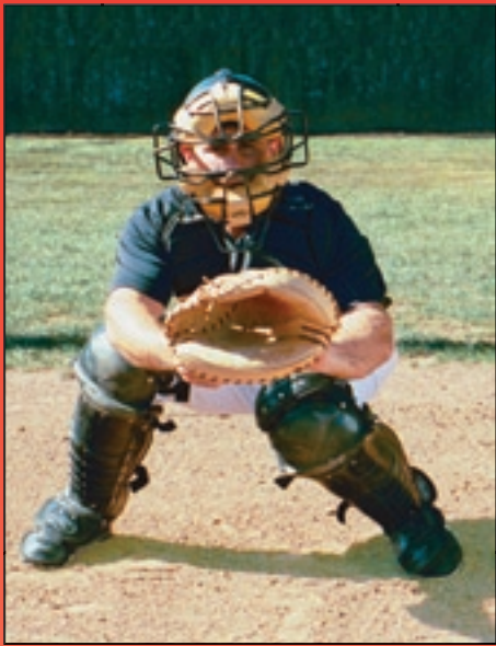
Break the Knee