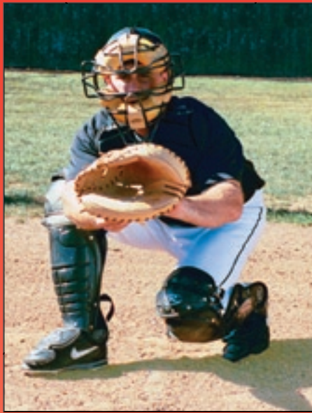
Back Leg Under