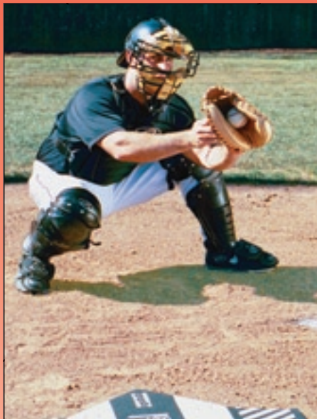
(left foot lead)